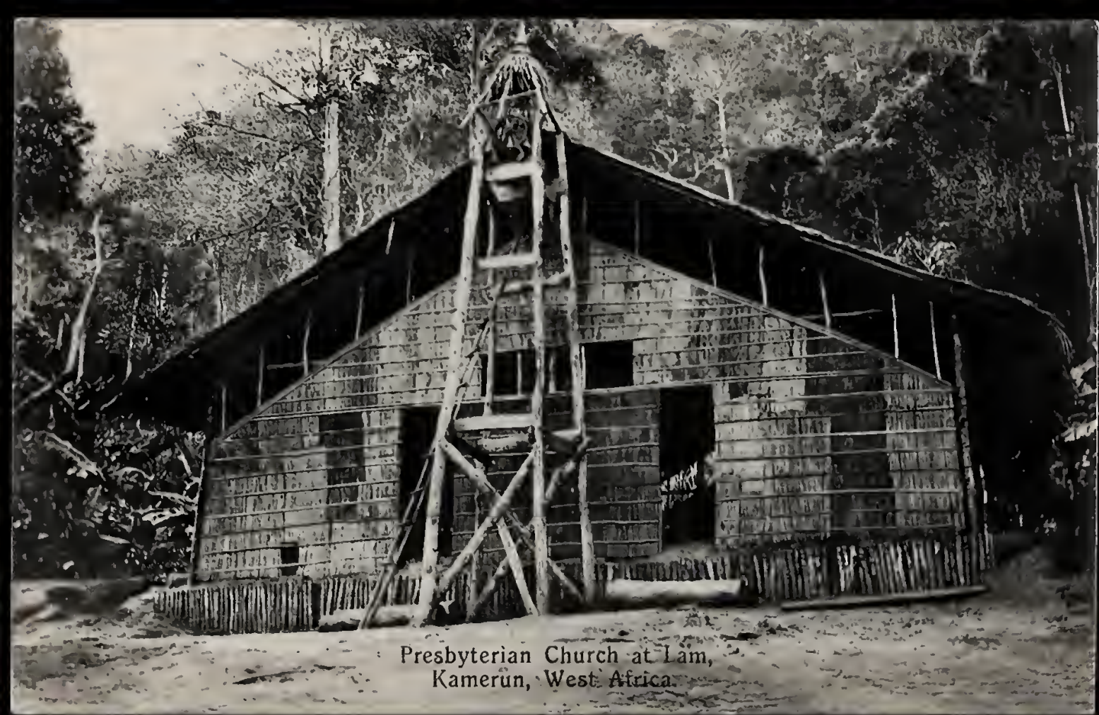
Presbyterian Church at Lam, Kamerun, West Africa.